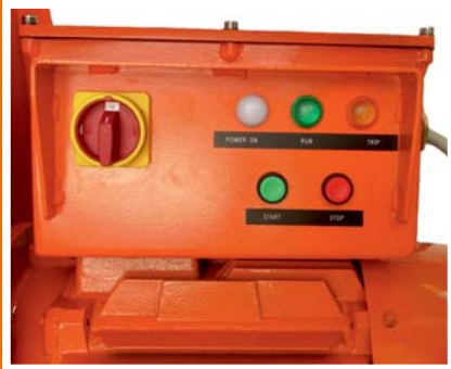
Die cast electrical box with main switch and overload relay.