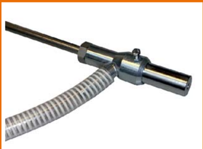
Sand Blasting Equipment