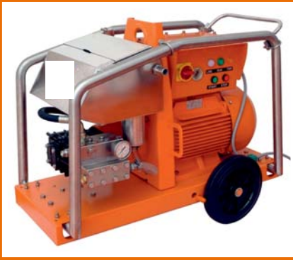
CE20-500 Super Slim