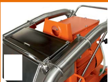
One centralized and balanced lifting eye.