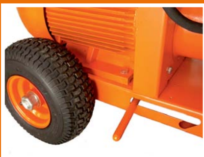
Galvanized frame with built in brake and pneumatic wheels.