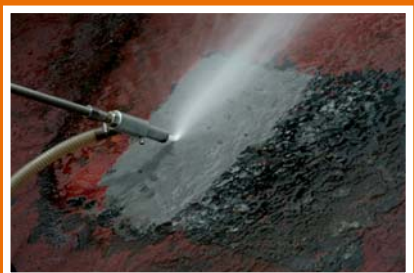
Surface - Sand blasting